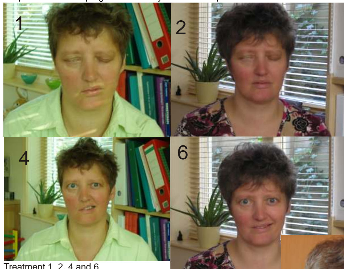
Treatment 1, 2, 4 and 6

In 2008 she worked more and more, just like her colleagues. Her treatments went on but just once every two weeks. Changes were still taking place, but not so quickly. In March she visited her neurologist and he is very surprised to see her progress almost a year after the operation.